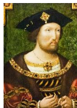
Henry's 'Great Matter'