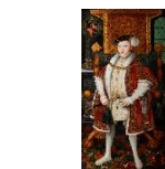
Henry VIII and Edward VI