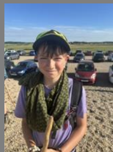
and 43 miles later, still smiling!

Attendance in year 7 was 93% this week. If your child reports of a sore throat or headache, please give paracetamol and send them in, every day matters. If your child has to have time off school, please ensure that you call the absence line on 01553 602874 or email studentabsence@kla.eastern-mat.co.uk to explain why; if we send you a text message and you are unable to respond, please send a note in with your child when they return to school explaining why they have been away. Please can I ask that if you do text my work phone or email me directly with absences, please contact the attendance officer too as I cannot guarantee that I will always see the messages.