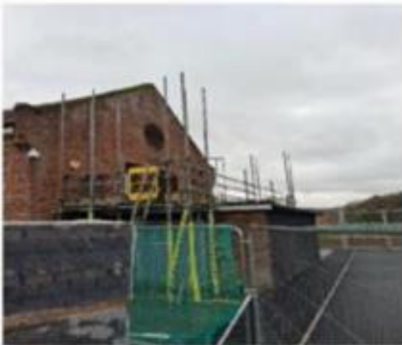
Preparing to start Section 6 works