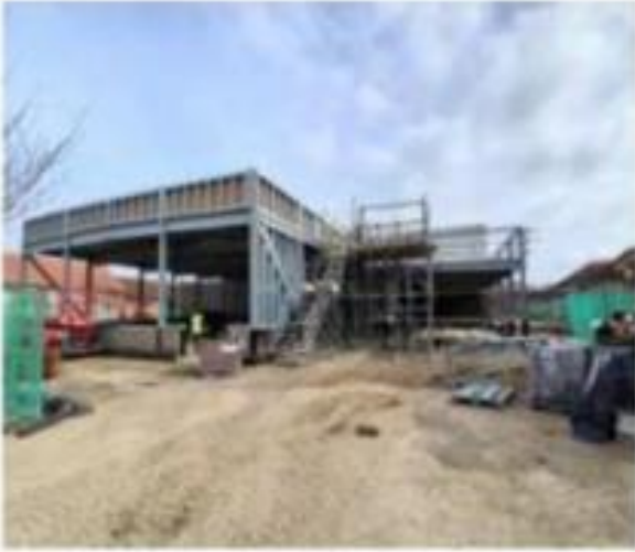
Dining Hall overview