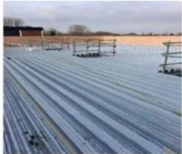
Metal deck installed on Dining Hall