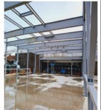
Dining Hall Steelwork Frame