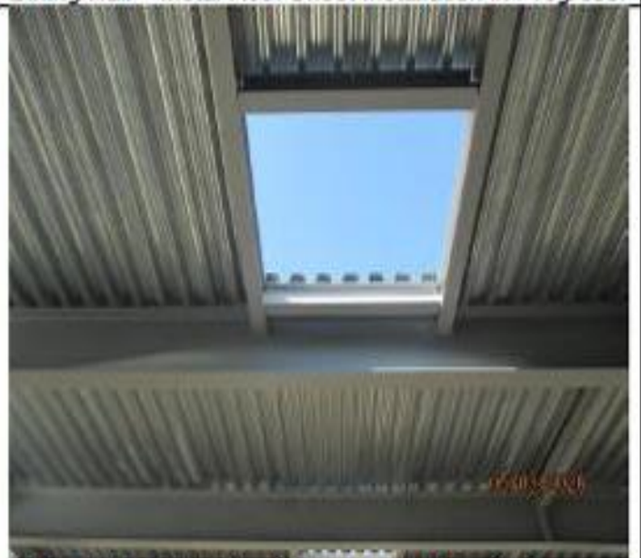
Dining Hall – Metal Roof Sheet Installation in Progress.