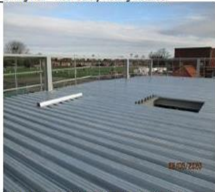
Dining Hall – Metal Roof Sheet Installation in Progress.