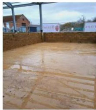
DT Block Slab Preparation Works & Masonry Foundations.