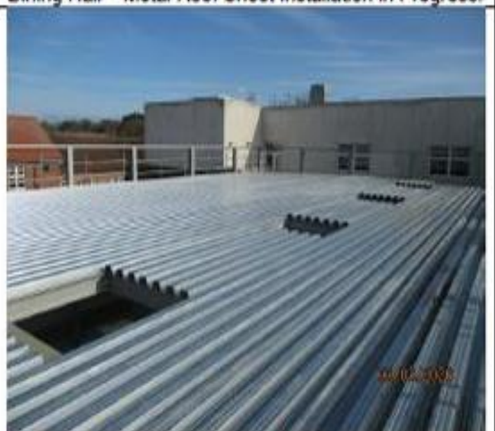
Dining Hall – Metal Roof Sheet Installation in Progress.