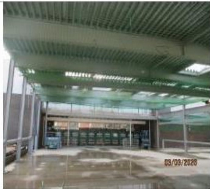
Dining Hall – Roof Safety Netting Installed.