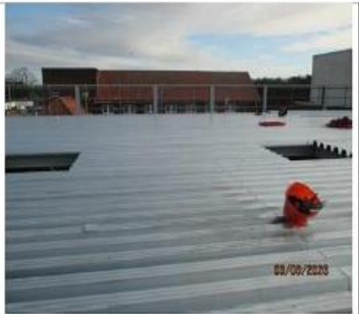
Dining Hall – Metal Roof Sheet Installation in Progress.