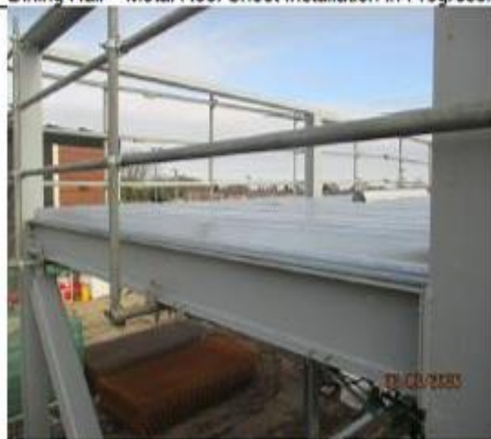
Dining Hall – Metal Roof Sheet Installation in Progress.