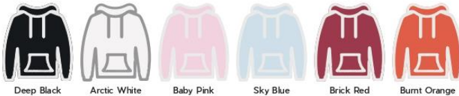
Deep Black Arctic White Baby Pink Sky Blue Brick Red Burnt Orange