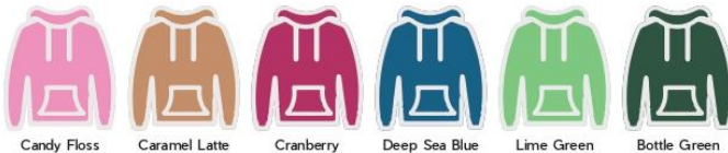
Candy Floss Caramel Latte Cranberry Deep Sea Blue Lime Green Bottle Green