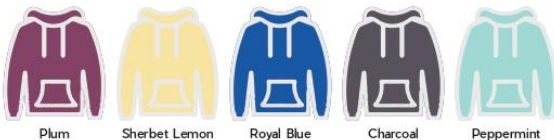
Plum Sherbet Lemon Royal Blue Charcoal Peppermint